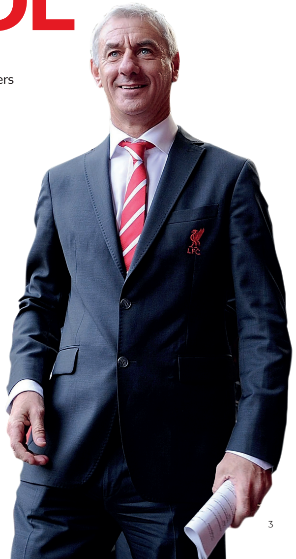
Ian Rush, LFC IA Ambassador